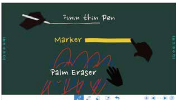
Enhance communication with discussion board/annotation.