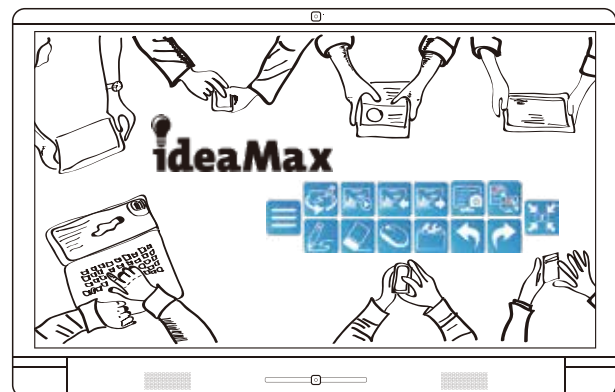
Quick access annotation & intuitive interface