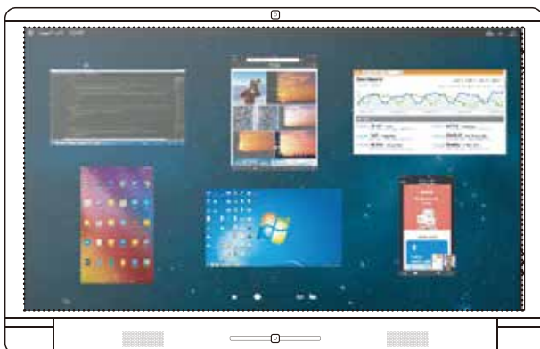
Communication connect anything